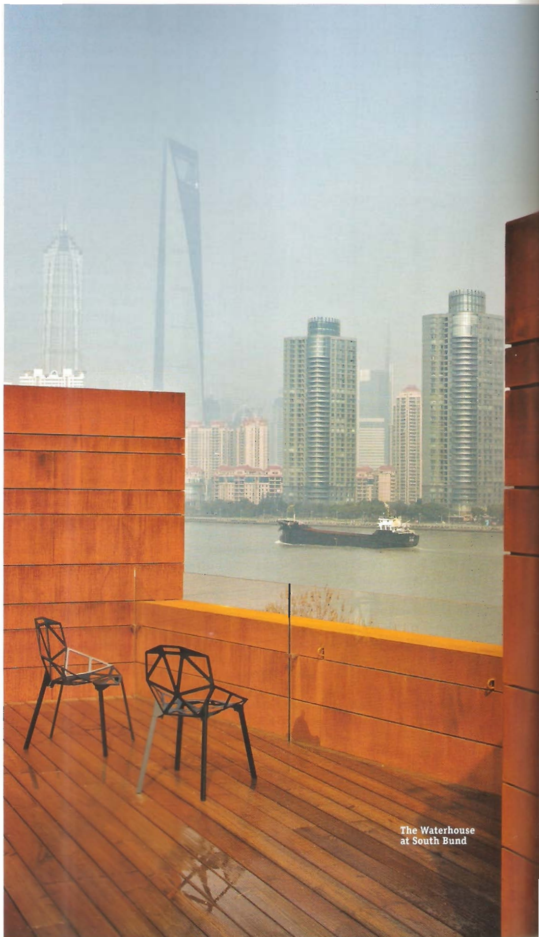
The Waterhouse at South Bund

The Club is the first boutique hotel venture from the same folks who brought you Harry's Bar. Housed within a historical shophouse located in Ann Siang Hill, it features modern in-room touches like rainforest showers and iPod docks. Bonus: a tapas bar and rooftop sky garden for