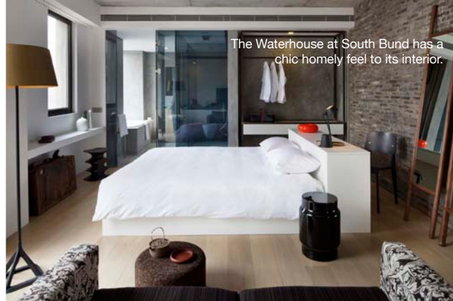
The Waterhouse at South Bund has a chic homely feel to its interior.