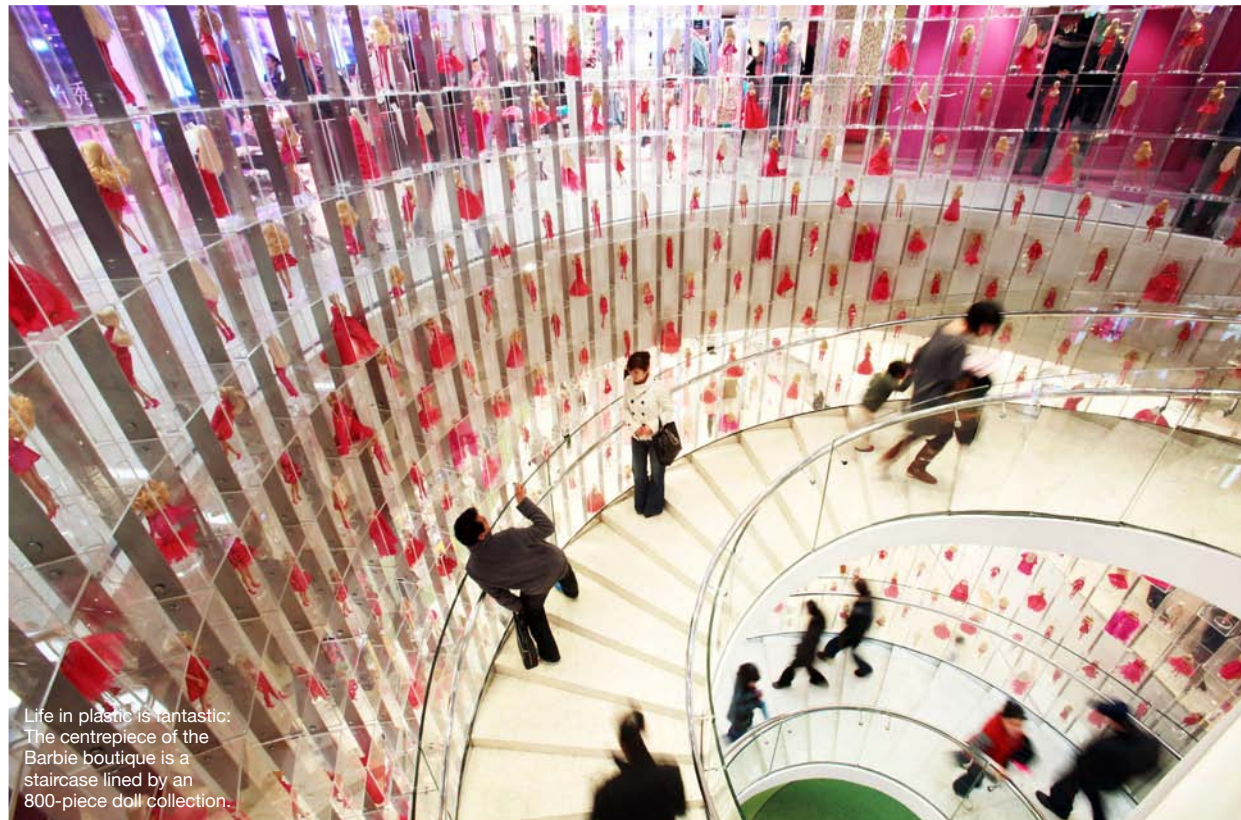
Life in plastic is fantastic: The centrepiece of the Barbie boutique is a staircase lined by an 800-piece doll collection.