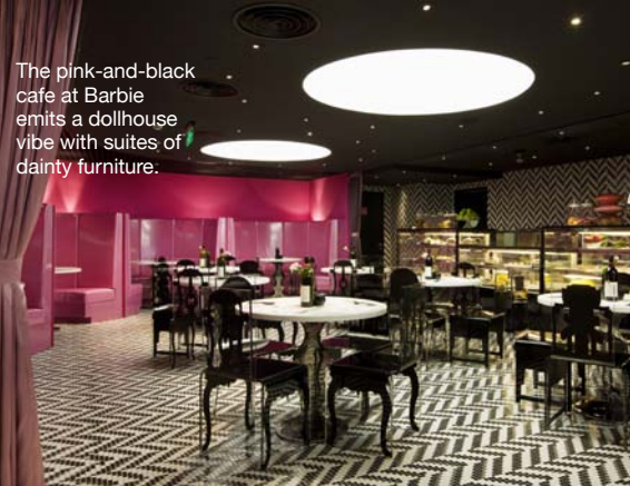
The pink-and-black cafe at Barbie emits a dollhouse vibe with suites of dainty furniture.