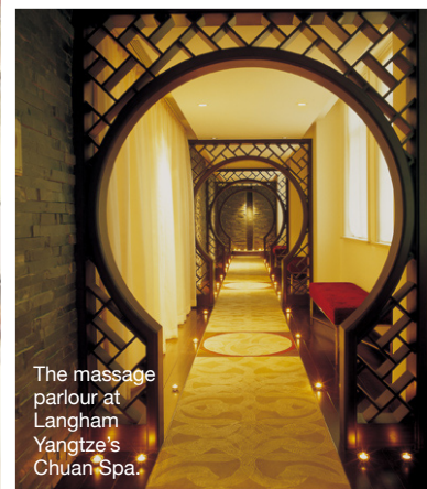
The massage parlour at Langham Yangtze's Chuan Spa.